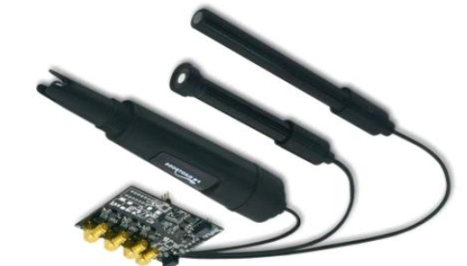
Fig. 3. Smart sensor board +probe wasp mote ODE

1) Smart water sensor: The sensor is used to monitor the quality of water. This is comprised of multiple sensors which measure a dozen of most relevant water quality. Wasp mote is the first device which monitors the water quality by interaction with the cloud. This sensor detects the amount of chemical in water (due to use of pesticides), remote measurements of swimming pool, and salt level in sea water.